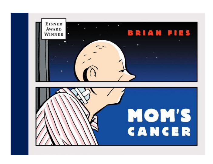
Brian Fies